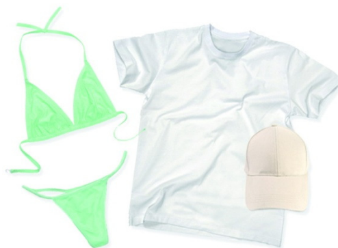
Cotton and other natural or synthetic white or light colored fabrics

CMYK or CMYW toner laser printers + heat press